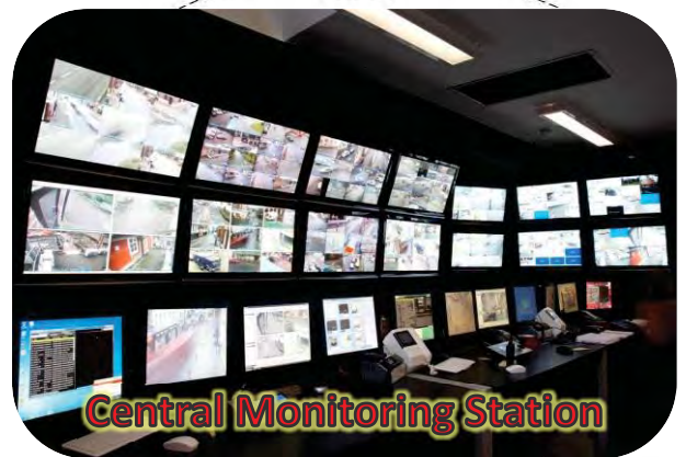
Central Monitoring Station

For each client of the 64 you will have up to 15 monitors: